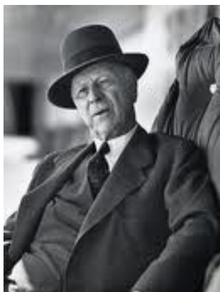
"The Great Wildcatter"